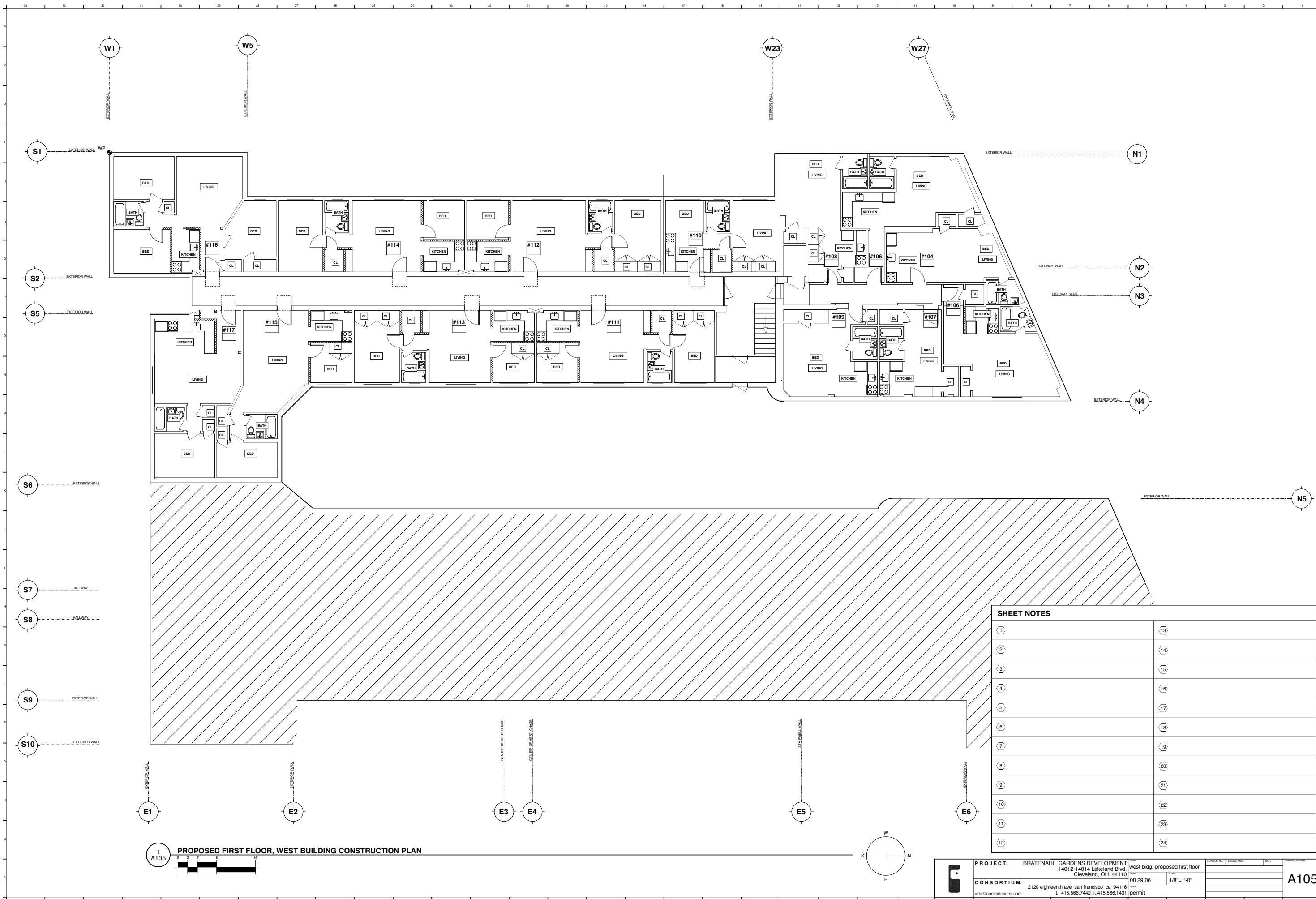
1 A105 PROPOSED FIRST FLOOR, WEST BUILDING CONSTRUCTION PLAN